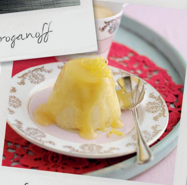
Lemon Sponge Pudding